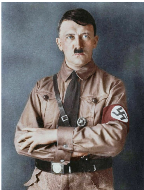
Adolf Hitler April 20, 1889 - April 30, 1945